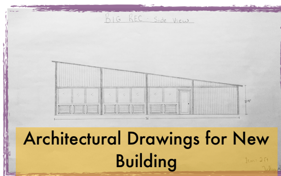
Architectural Drawings for New Building

The Big Rec has been torn down, and the brand new Big Rec is being built in a new location above tennis! This gorgeous new building will have a stage, lighting and sound system that will be PERFECT for School of Rock, Cabin Karaoke Periods, Airbands and so much more!